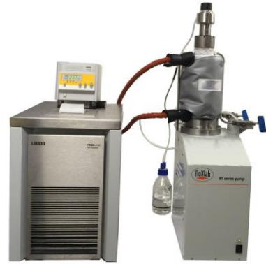
BTSP CO 2 pump with cooling bath