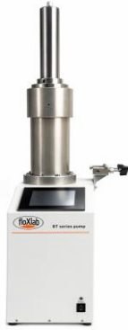
BTSP 500-5 H 2 — Hydrogen application