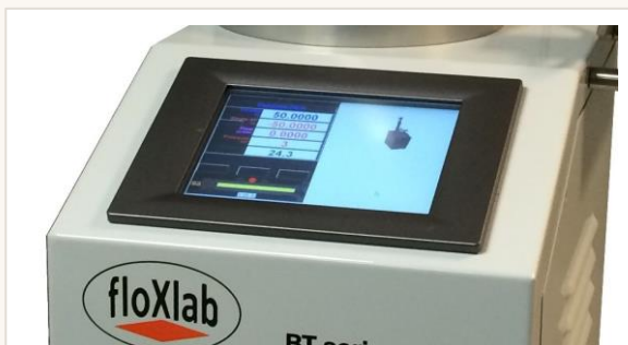
Touch-screen control panel — computer-independent operation

Common across all Floxlab syringe and continuous-flow pumps