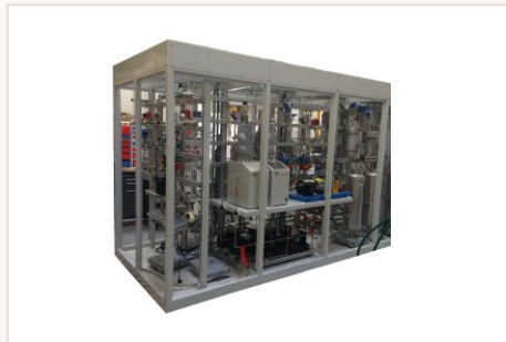
CHEMISTRY & PROCESS Heavy feedstock Pilot plant