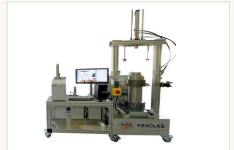
FRACLAB Hydraulic fracturing

SECTORS: Rock Mechanics · Reservoir Engineering · H 2 & CCUS · Hydraulic Fracturing · Petrophysics · Chemistry & Process